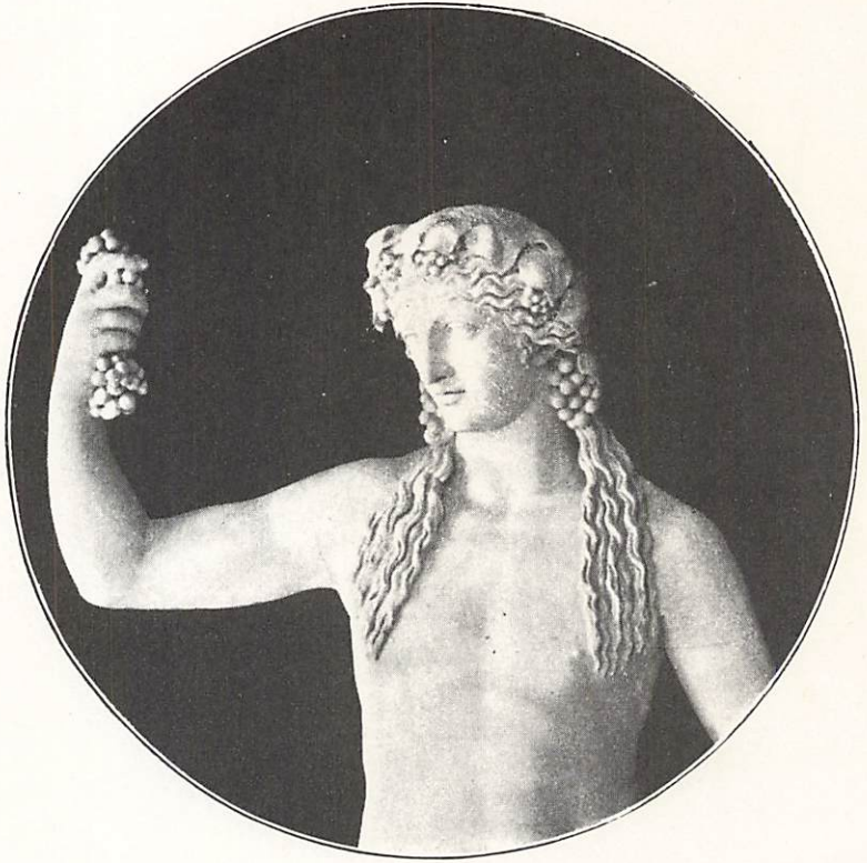
Dionysius the Divine Self