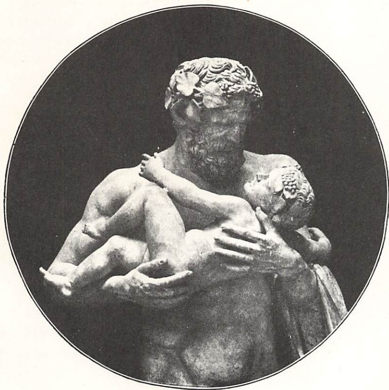
Silenus and the Infant Dionysius